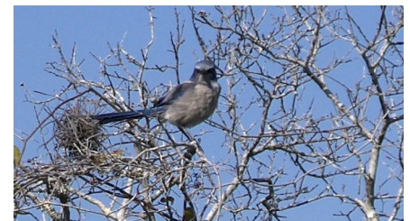
Preserving habitat for the Florida scrub-jay (bottom) helps preserve the mission at Cape Canaveral Space Force Station (top).